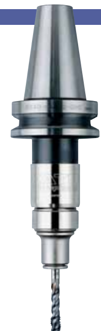
BT40-HA412-M-OHC + TC412-MO