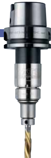
HSK-A63-HA412-M-OHC + TC412-MO-SB