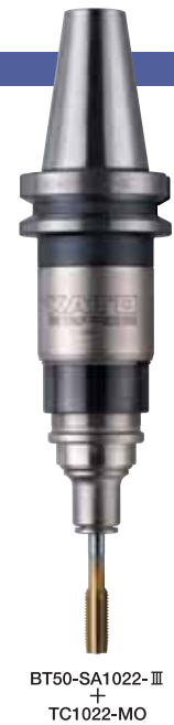
BT50-SA1022-III + TC1022-MO

※F2 and F4 are referential values. ※F2,F4量は参考値です。